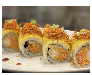
Treasure Hunter Roll

Inside – smoked salmon, avocado, cream cheese Outside – seared white tuna, scallion Sauce – wasabi mayo & Japanese dressing