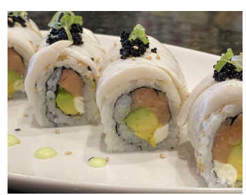
White Russian Roll